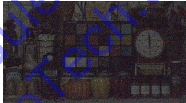
New product IMX323LQN Gain 45 dB