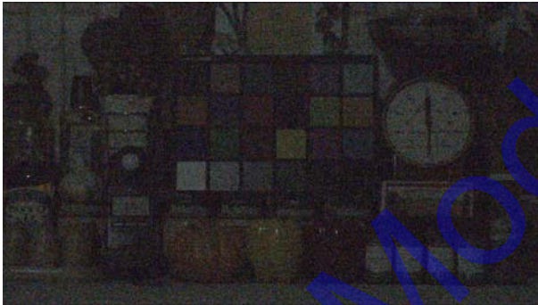
Existing product IMX222LQJ Gain 42 dB

Conditions: 0.1 lx, F1.4 (ADC 12 bit mode, 30 frame/s)